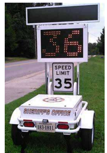
SMART 850 with variable message sign