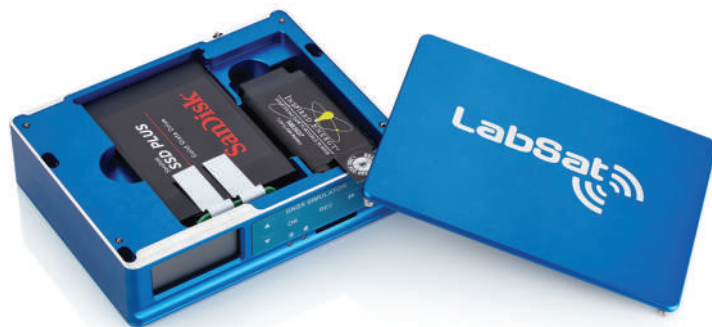
LabSat 3 Wideband - Greatly increases GNSS Record and Replay capabilities

LabSat 3 Wideband is housed in a conveniently small enclosure measuring 167mm x 128mm x 46mm and weighing only 1.2kg, so it can be used to record GNSS signals anywhere. Subsequent replay is entirely realistic to allow for robust product development and testing.